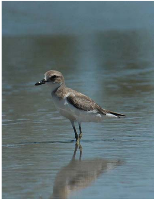
Greater Sand Plover