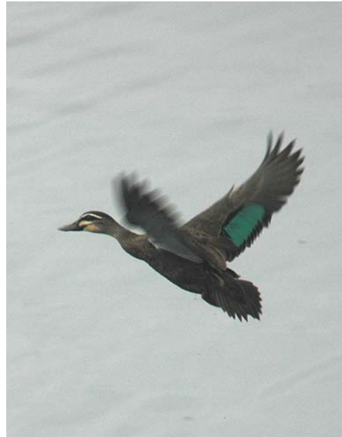
Pacific Black Duck

This morning was spent shopping and visiting airline offices. We were told from both Merpati and Transnusa that all the flights to Sumba and Timor were full the next 5 days. We found out that there was a ferry between Aimere and Waingkapu on Tuesdays. After having bought enough food to stay couple of days at Danau Ranamese, we took a slightly over-priced bemo 150.000 Rp to this lake area. The 'resort' turned out to be a strange place with an amount of empty and very basic, forgotten-looking bungalows and some rangers working there.