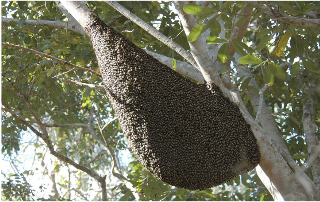
Asian Giant Honey Bees