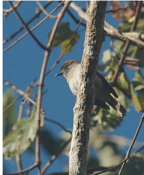
Sumba Jungle Flycatcher

In the evening we went back to km 69 to try again for the boobooks. This time Little Sumba Boobook was calling in a tree very close to us, but stayed hidden among the thick canopy.