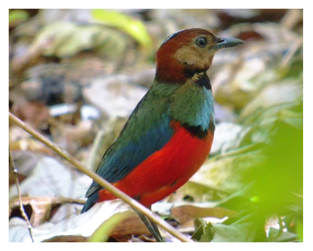
Red-bellied Pitta – Tangkoko, October 2009